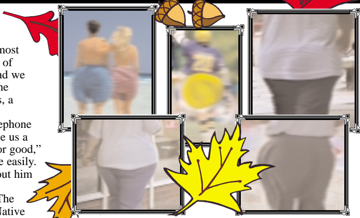
Many amateur photographers have taken photos of their close encounters with Big Butt. Some are most certainly fakes, all are poorly focused, and not one could constitute solid evidence of Big Butt's existence. But while we can easily dismiss the majority of them, a few remain that we can't, and they tease us with one simple question—does Big Butt really exist?