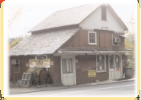
The Sportsman's Pride is Buttzville's pride! And you probably won't miss it as you pass by on U.S. Route 46 going through the center of town. Hard to believe that it could be for rent, but we're sure it won't be available for long!

Rather, we want to remind all Butopians here and now that what we have in common means so much more than our minor grammatical and spelling differences. Be wary of anyone who, for their own selfish gain, tries to create friction among the community by amplifying those differences. And above all, have some tolerance for someone who looks at a but(t) a little differently from the way you do.